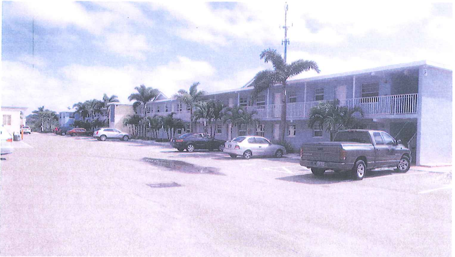
FRONT ( NORTH SIDE) TAKEN 02/13/2014

If using the Elevation Certificate to obtain NFIP flood insurance, affix at least 2 building photographs below according to the instructions for Item A6. Identify all photographs with date taken; "Front View" and "Rear View"; and, if required, "Right Side View" and "Left Side View." When applicable, photographs must show the foundation with representative examples of the flood openings or vents, as indicated in Section A8. If submitting more photographs than will fit on this page, use the Continuation Page.