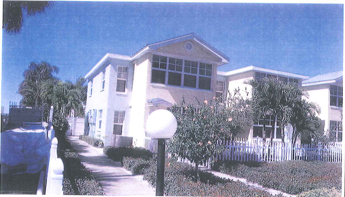
SIDE AND REAR VIEW ( EAST SIDE) TAKEN 02/17/2014

If submitting more photographs than will fit on the preceding page, affix the additional photographs below. Identify all photographs with: date taken; "Front View" and "Rear View"; and, if required, "Right Side View" and "Left Side View." When applicable, photographs must show the foundation with representative examples of the flood openings or vents, as indicated in Section A8.